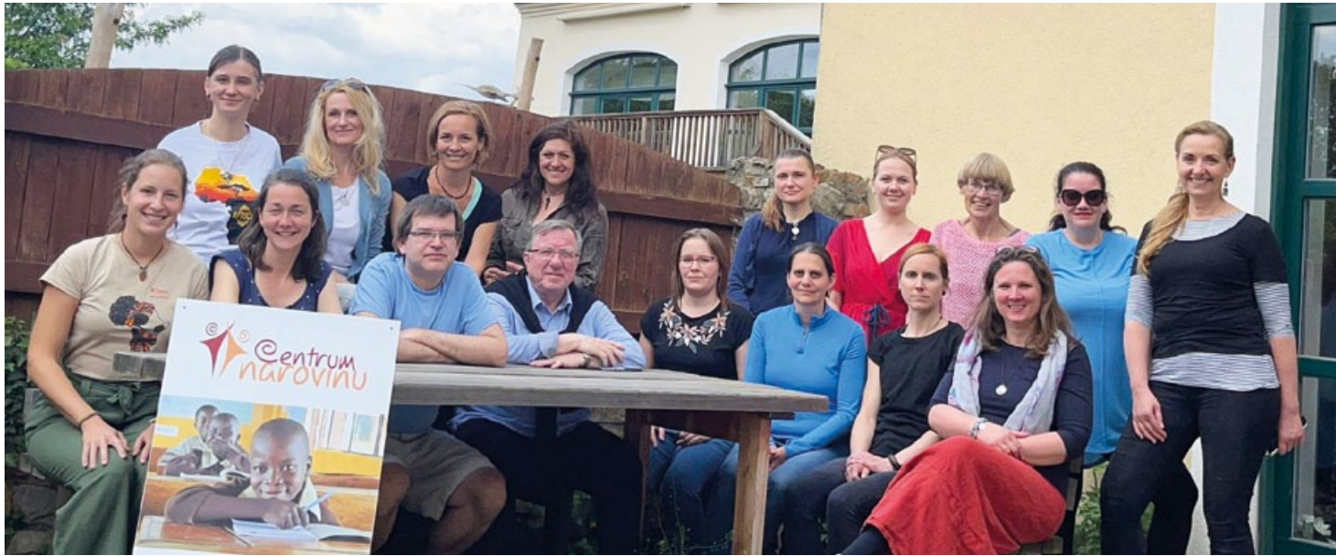
From the May meeting with our volunteers in the Czech Republic

I really enjoy poems and I write them for all my friends, for example for their birthdays, so I also made one for the Centrum Narovinu.